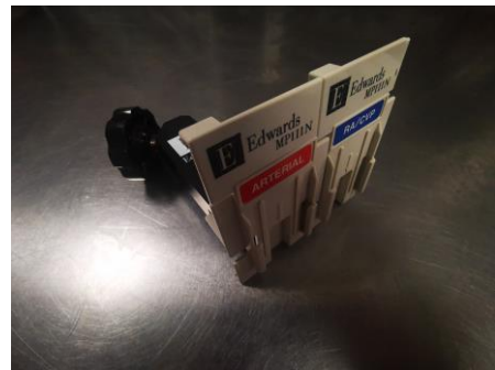
DOUBLE TRANSUCER PLATE