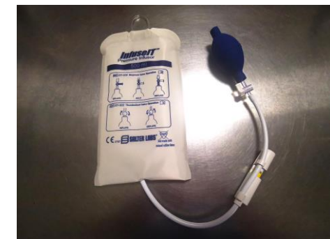
1X 500ML PRESSURE BAG